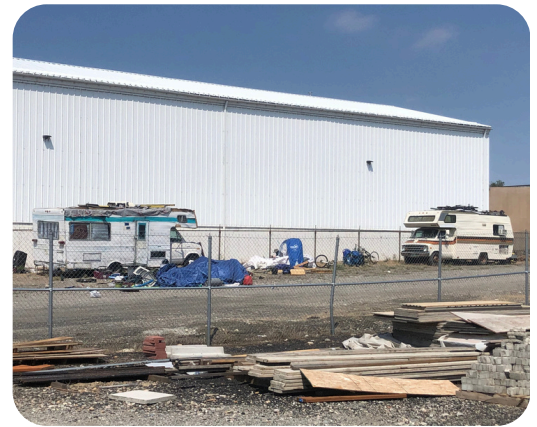
Results in our neighborhood during Jewels Helping Hands' occupation in 2021